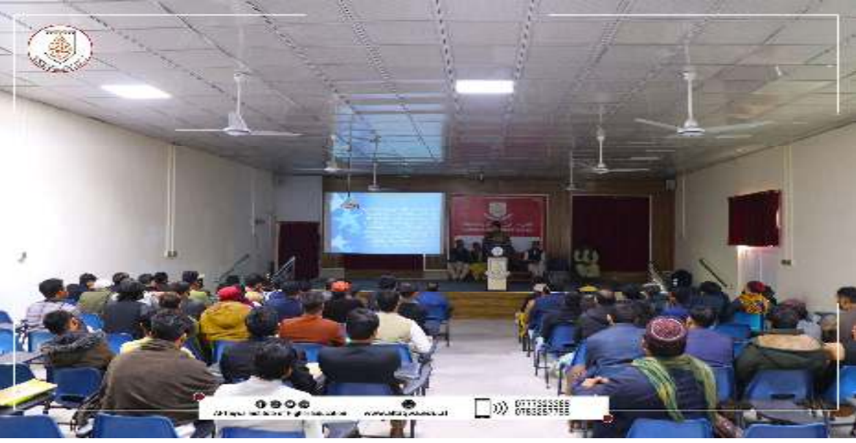
One-day Seminar On SDGs