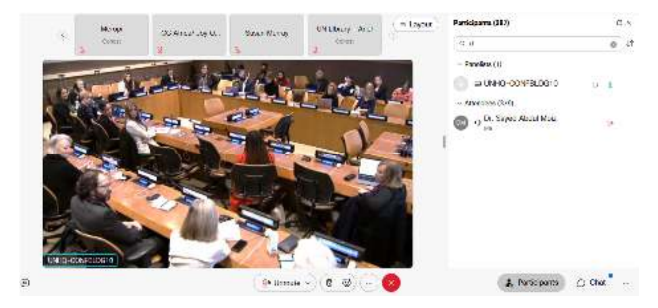
(ATIHE) Participates in the United Nations' 3RD Open Science International Conference.

For more information, please visit: <a href="https://www.altaqwa.edu.af/blogsConference/44">https://www.altaqwa.edu.af/blogsConference/44</a>