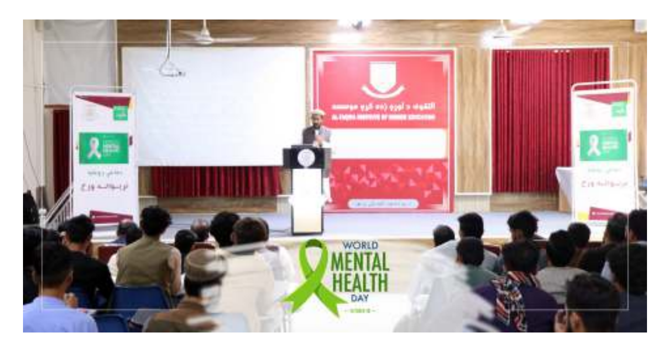
The Faculty of Economics at Al-Taqwa Institute of Higher Education holds World Mental Health Day on October 10th.

For more information, please visit: <a href="https://www.altaqwa.edu.af/blogsQualityEvent/52">https://www.altaqwa.edu.af/blogsQualityEvent/52</a>