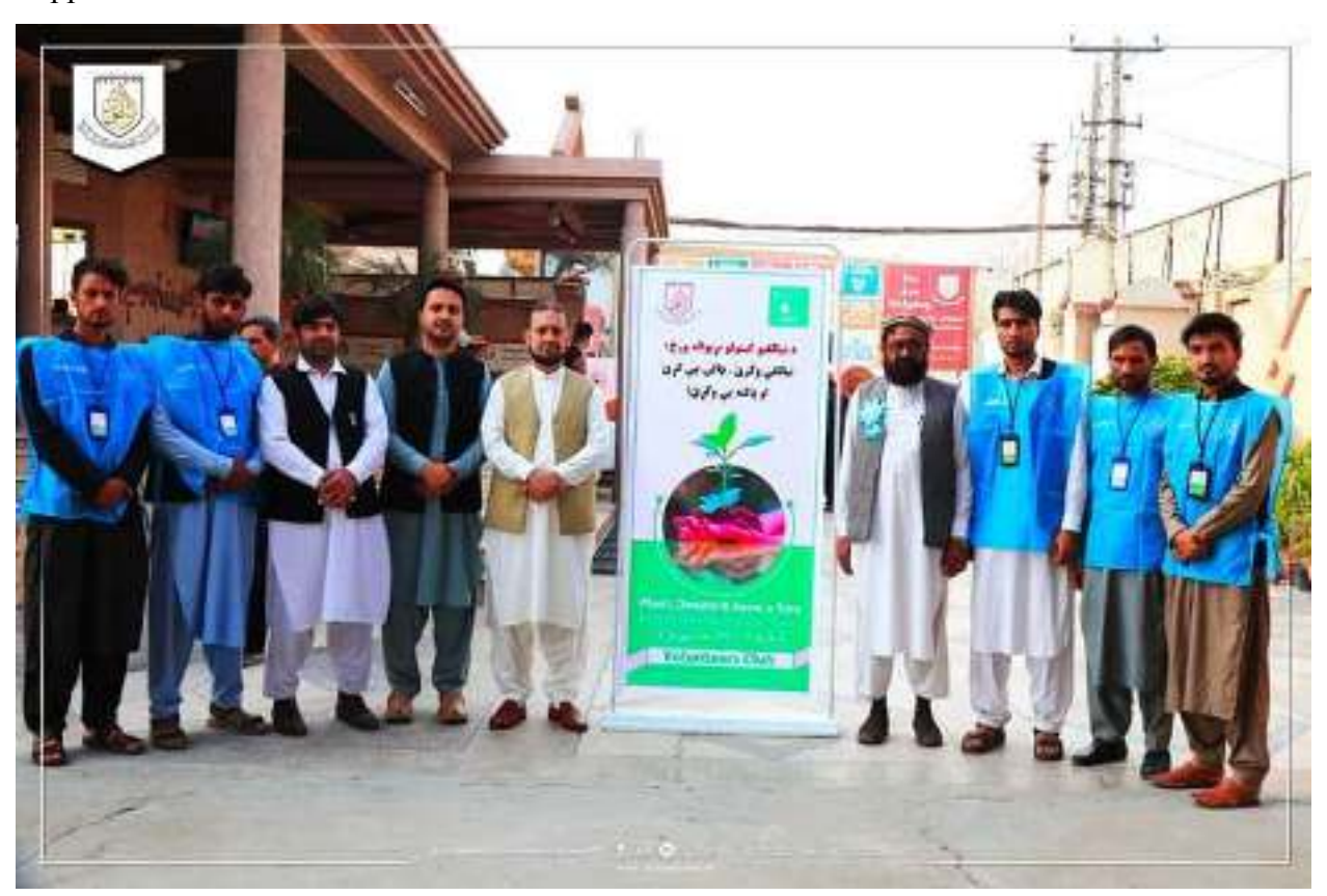
World Planting Day Celebrated!

So We Invite All Our Kind Students And All Those Who Love To Assist The Needy To Come To Al-Taqwa Institute Of Higher Education And Join Us In This Vital Club Where Everyone Can Support Someone Who Is In Trouble.