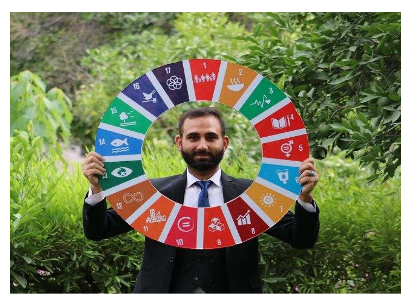
Sustainability at Al-Tagwa Institute of Higher Education

Sustainability is a strategic priority at Al-Taqwa Institute of Higher Education reflected in everything we perform – from training our students on the fundamentals of sustainability conducting cutting-edge research and ensuring that our campus operations are delivered in a sustainable and future-friendly manner. We work with national and international sustainability partners to integrate sustainability into our teaching, research, and operations while raising public awareness about the significance of sustainability across our public engagement initiatives.